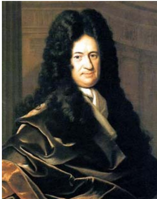
Gottfried Wilhelm Leibniz (1646-1716)